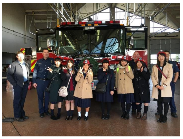
Students enjoying their tour of the main fire station in Fairfield