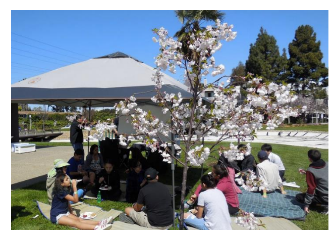
Guests and volunteers share food under the cherry blossoms at Braly Park on March 25

Blue skies after a week of clouds and rain. What a miracle! On Saturday March 25, the Sunnyvale Sister City Association held their 2<sup>nd</sup> Annual HANAMI at Braly Park, the site of more than 20 lizuka-donated cherry blossom trees. This year 40 people attended the potluck, which took place under the fully bloomed trees. Though still young, each tree carried many blossoms, and I look forward to seeing how they grow between now and next year's event!